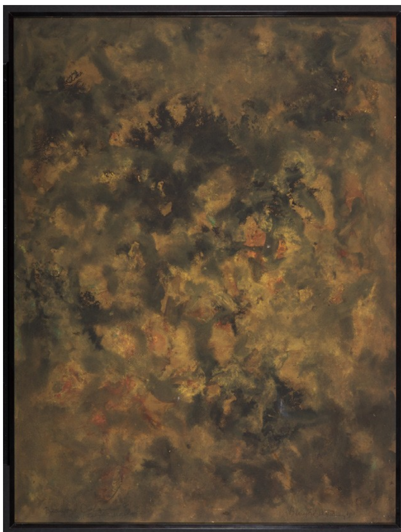
Untitled - 1961 – oil on canvas – 34.8 in x 19.9 in