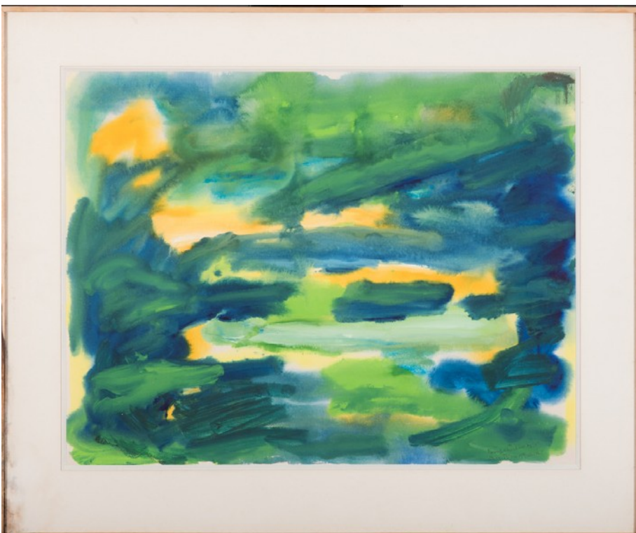
Untitled – 1961 – mixed media on paper – 25.4 in x19.3 in

Between 1964, the year of his exhibit at the Lambert Gallery, and 1973, when he exhibited at the Darthea Speyer Gallery, he painted some of his best and most powerful abstract and colorful works, with spontaneous gestures evoking cursive writing and calligraphy.