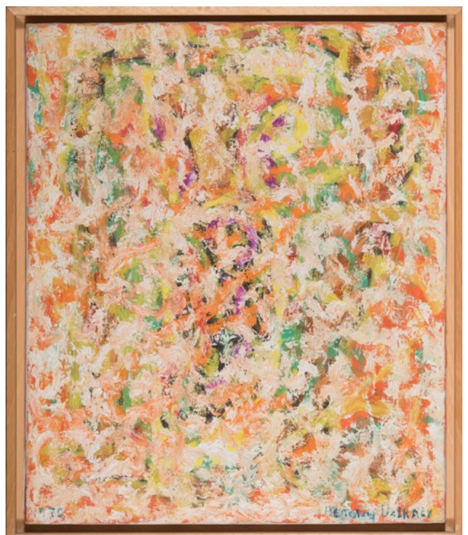
Untitled - 1976 – oil on canvas – 21.6 in x 18.9 in

Offering a New York-Paris vision of the postwar period and of contemporary art, this exhibit brings over thirty paintings and works on paper from private Paris collections together for the first time. Until now, the majority of these works were previously unknown to the general public in the United States and Europe.