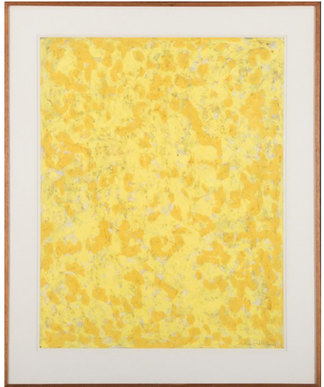
Untitled - 1960 – gouache on paper – 14.9 in x 28.7 in

Conference topics will center on the place that African Diaspora art holds in the international market, as well as the place of the artist who lives in Western society and also belongs to this Diaspora.