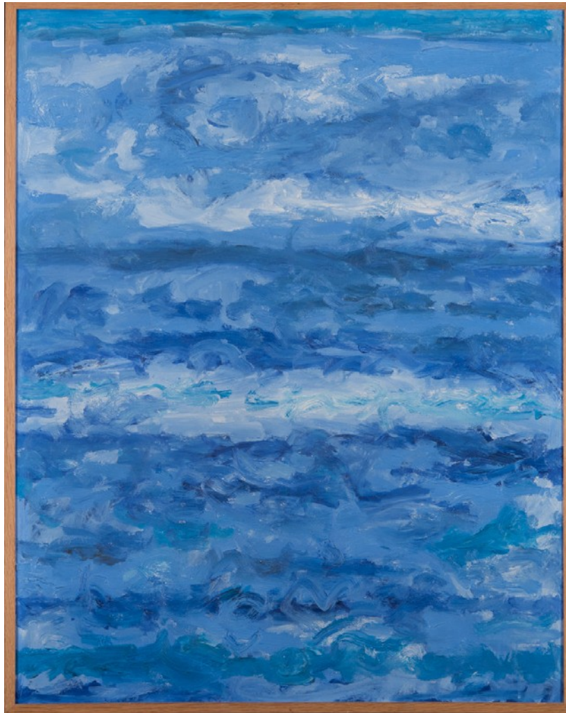
Greece - 1967 - oil on canvas - 35.8 in x 28.3 in

Les Amis de Beauford Delaney and Wells International Foundation